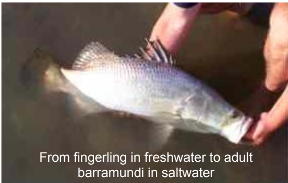
From fingerling in freshwater to adult barramundi in saltwater